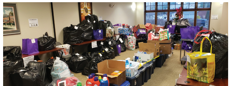
Christmas Gifting Program ready for pick up