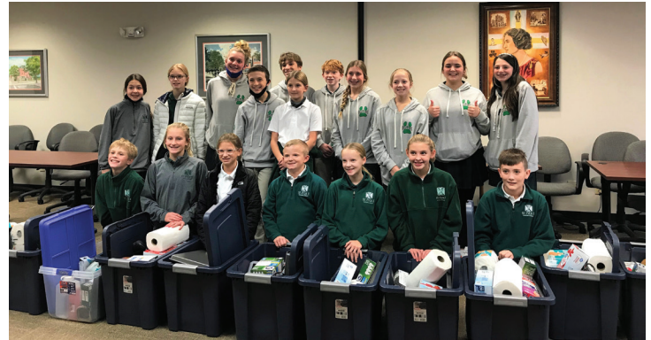
St. Pius Student provided bins for the St. Joseph Apartments

It is clear, all those seeking our help, left a little happier than when they arrived. Beyond the walls of Catholic Charities and the Parish Kitchen, is where the magic happens...because of each of you; your gifts, time, talents, and treasures. I'm reminded of what Mister Fred Rogers once said, "It's not so much what we have in this life that matters. It's what we do with what we have."