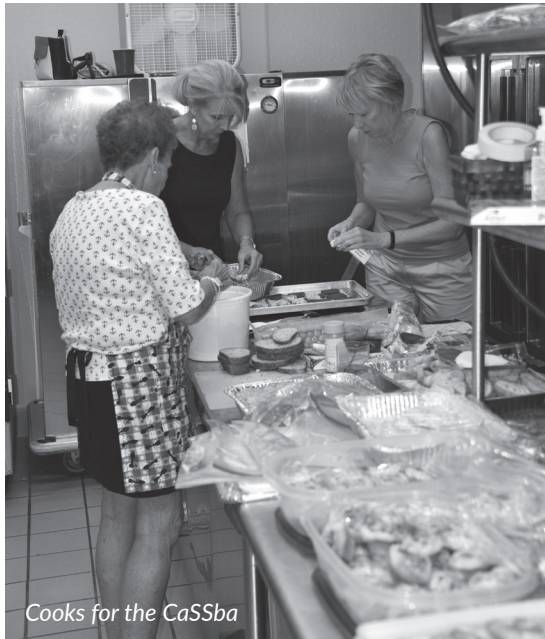
Cooks for the CaSSba