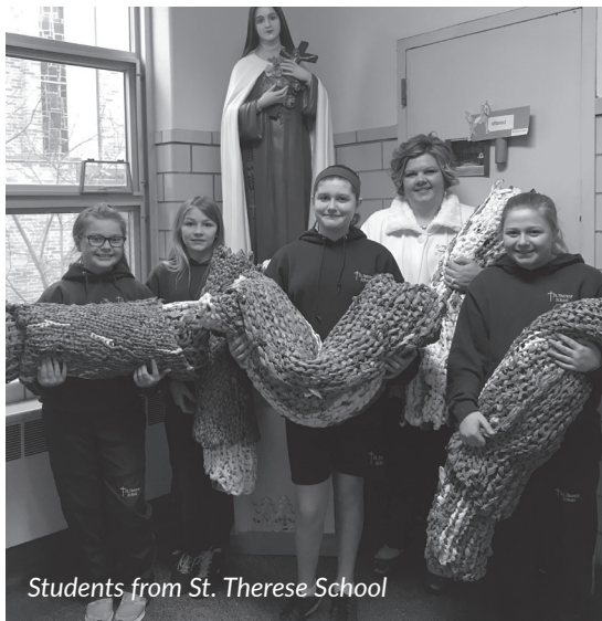
Students from St. Therese School