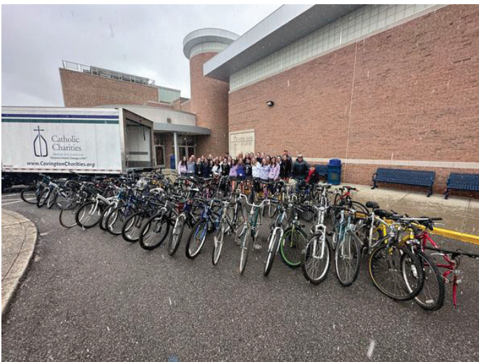
Notre Dame Academy

Are you ready to dust off that bike hanging in your garage and be the next link in this chain of generosity? Help us meet our 2024 goal to distribute four hundred bikes! Please visit www.covingtoncharities.org to learn more. To donate a bike, reach out to the Pickett's Corner team at pickettscorner23@gmail.com . Let's keep the wheels turning for those in need!