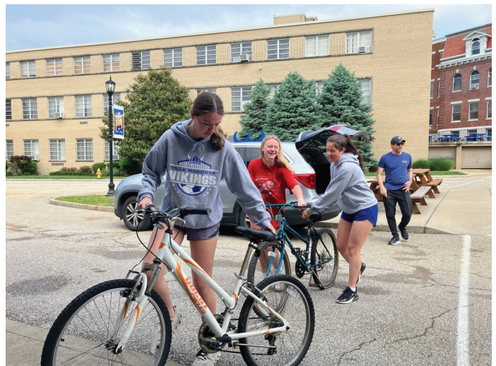
Villa Madonna Academy