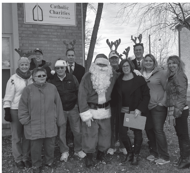
Pictured is Santa and his team delivering Christmas gifts to our St. Joseph Apartments.