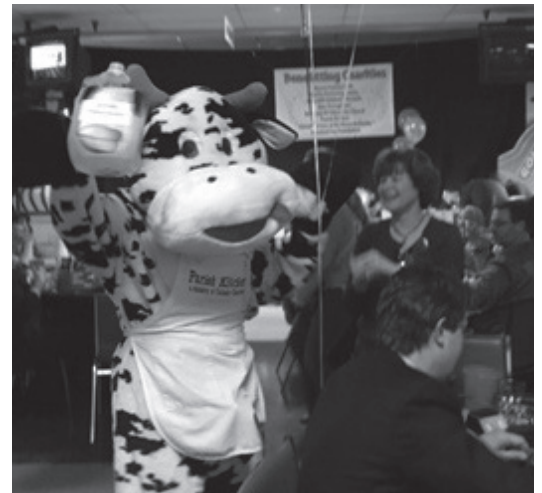
Pictured are the festivities from last year where Parish Kitchen had the most admission ticket sales and second in chip count, raising over $3,000 for the Got Milk Campaign. Please help support Parish Kitchen this year.

Don't forget to select PARISH KITCHEN at ticket purchase.