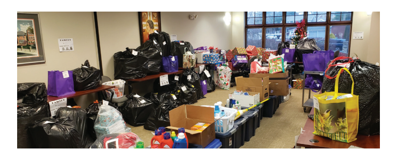
Christmas Gifting Program ready for pick up