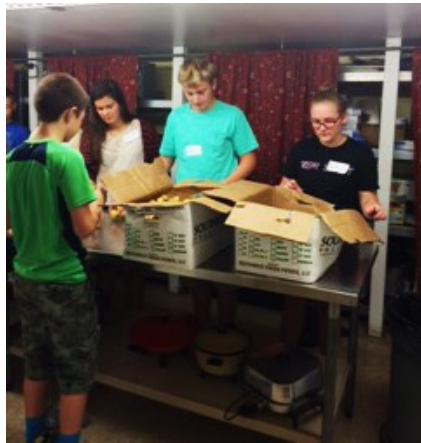
Youth working on a service project at SEEK

There is a new program modeled after the former Insights Program at Catholic Charities. It is called SEEK ( S erve others, E ducate ourselves, E vangelize about need and K eeep our brothers and sisters in prayer). The program is an all-day retreat for those students preparing for the sacrament of Confirmation to learn about the needs of low income families.