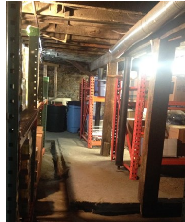
Parish Kitchen's new storage shelving