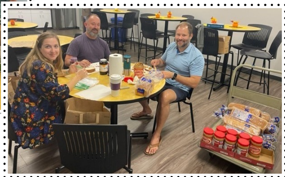
Weltman, Weinberg & Reis collect & prepare sandwiches