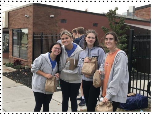
St. Henry Seniors preparing and serving lunches

Saint Henry District High School seniors spent the second day of their senior retreat learning about poverty and homelessness in the Covington community. Students had the opportunity to see the face of Christ by serving packed lunches to people waiting outside Parish Kitchen. One student reflected on their experience saying they noticed the joy and sincere gratitude in each person they encountered.